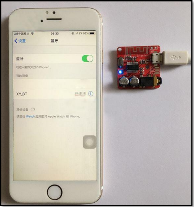
Made in China